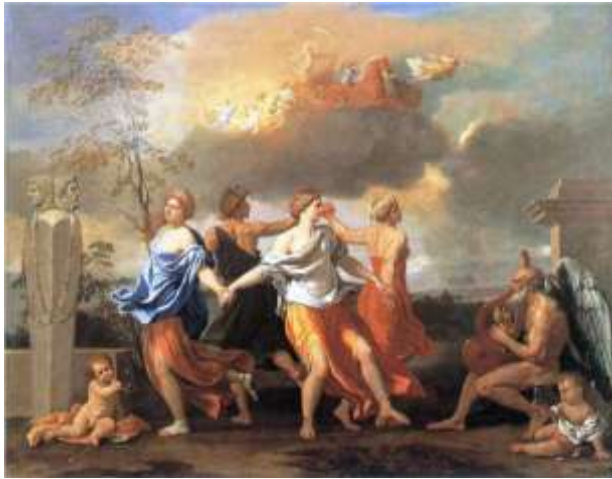
(Artist: Nicolas Poussin Date: 1634)

I have understood the play of pride and delusion.