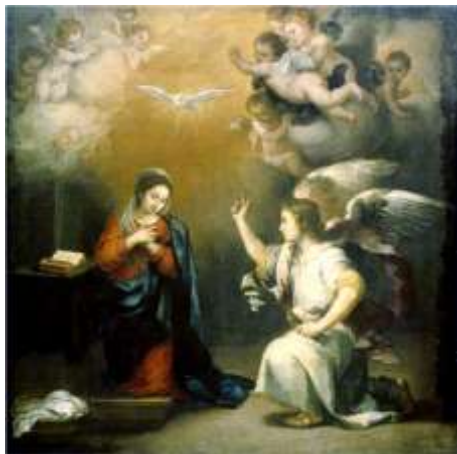
(Artist: Bartolome Esteban Murillo Date: 1680)

I shall soon reveal to you my mysterious response.